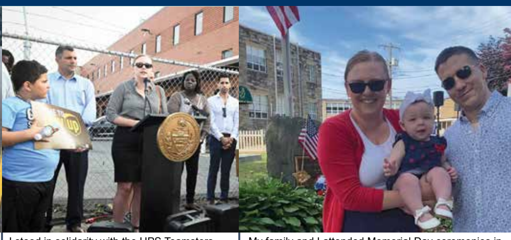
I stood in solidarity with the UPS Teamsters this summer for better working conditions and wages amid contract negotiations.