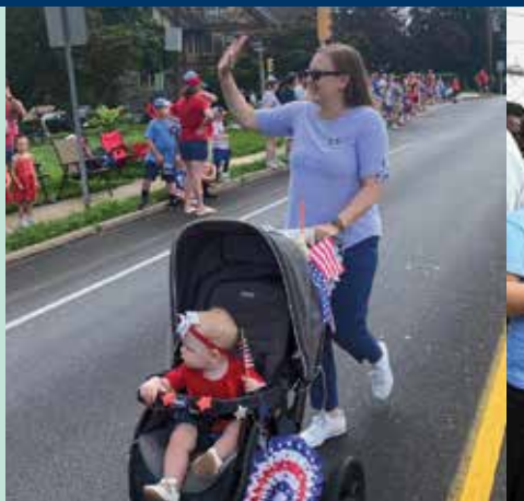
Thanks to the amazing communities of Springfield, Swarthmore, and Marple for putting on incredible Fourth of July celebrations!